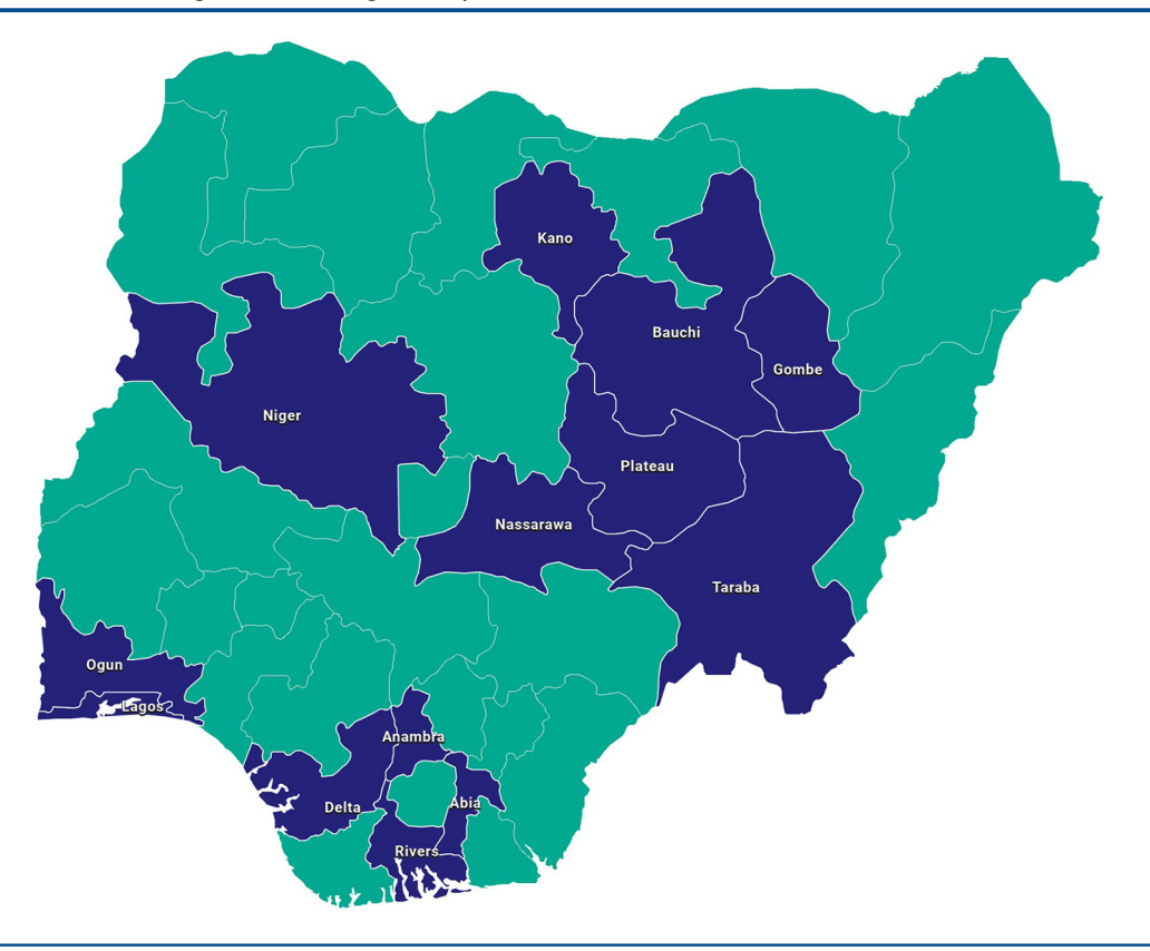
FIGURE 2. The Challenge Initiative Nigeria Implementation States

The TCI cofinancing model serves to strengthen system capacity and institutionalize funding for FP into routine processes, institutions, and funding flows.