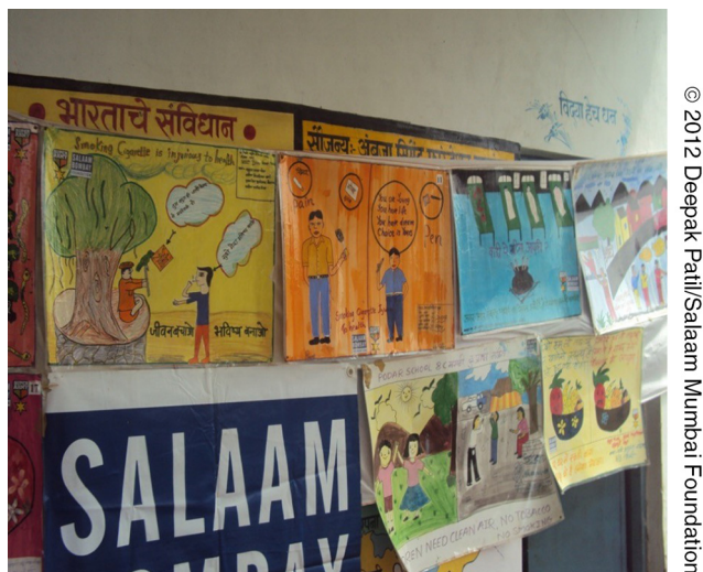
© 2012 Deepak Patil/Salaam Mumbai Foundation