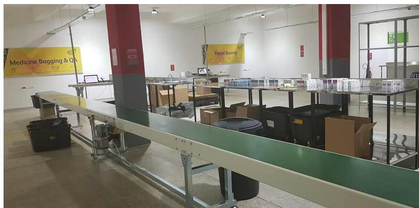
The Central Dispensing Unit warehouse in Ndola, Zambia.

Although we did ask survey respondents to report the numbers of sites or facilities implementing each model and of patients participating, in most cases we were unable to obtain complete or accurate data for these. Where such numbers were available, it was generally not possible to confirm that no patients were double-counted in other implementer reports or that no individual