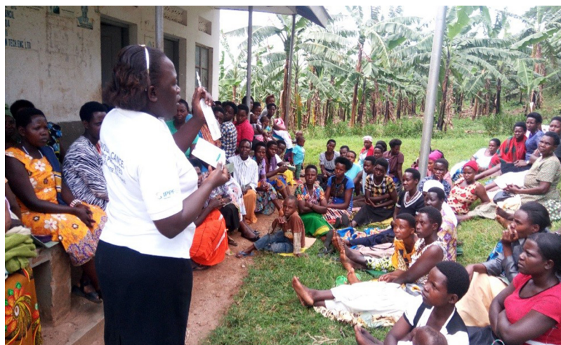
During an RHU outreach event in Kabarole district, Uganda, a provider shows women waiting for family planning services what Sayana Press looks like and provides information about the method.

Quantitative data were based on family planning service statistics extracted from RHU's static clinics, VHTs, and mobile outreach activities in the study districts. For each service delivery channel (i.e., static clinics, VHTs, and outreaches), information was collected on the number of family planning services provided by age category of recipients (below 25 years and 25 years or older). Family planning service data were captured using standard registers, which had been adapted to include DMPA-SC as a new family planning method. At the community level, VHTs captured family planning client records using VHT registers, which were submitted to RHU facilities on a monthly basis. Prior to the start of the project, RHU trained VHTs and RHU's facility-based providers on data collection, storage, and reporting procedures. Data from each service delivery unit were entered into RHU's District Health Information Software