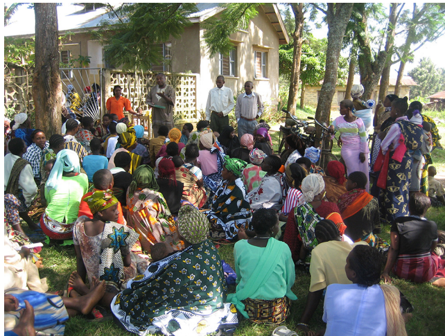
Health facility staff discuss family planning options with women waiting for outreach services in northern Tanzania.

procedures at other facilities where it was not routinely available.