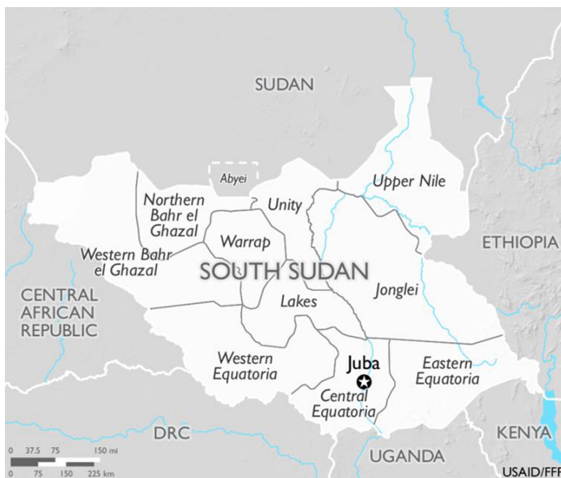
FIGURE 1. Map of Republic of South Sudan Showing Current Member States

VAD problem in South Sudan among children aged younger than 5 years is currently considered to be at least moderate, but very likely severe, based on the high U5MR, the WHO regression analysis findings, and high rates of undernutrition.