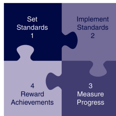
FIGURE 1. The 4 Steps of the Standards-Based Management and Recognition (SBM-R) Approach