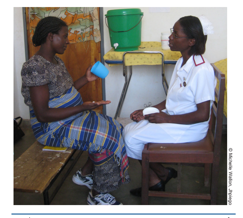
In Malawi, a pregnant woman receives intermittent preventive treatment for malaria at an antenatal care visit.

Abbreviations: ANC, antenatal care; IPTp, intermittent preventive treatment of pregnant women; ITN, insecticide-treated bed net; MIP, malaria in pregnancy. a 2010 Malaria Indicator Survey.