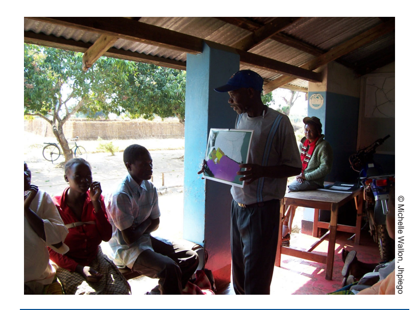
In Zambia, a counselor educates community members at an antenatal care clinic about use of insecticide-treated bed nets.

Problems with commodity stockouts, quality assurance, and financing accounted for the most significant MIP program challenges in the 3 countries.