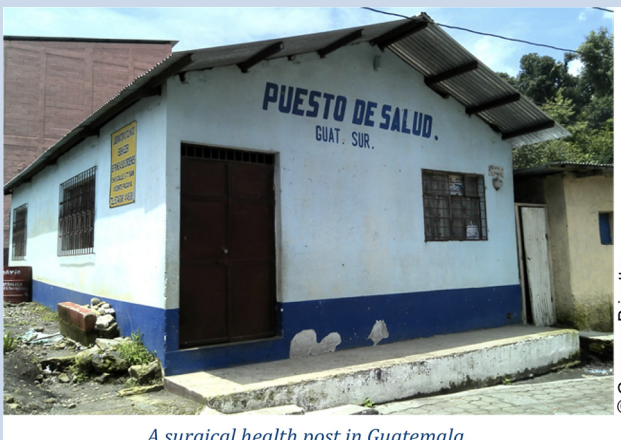
A surgical health post in Guatemala.