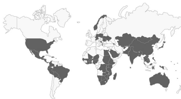
FIGURE 2. Locations of RSPH Summer Field Experiences, 1985–2014

Note: Partial data were used for years prior to 2009. Data were not available for 2010.