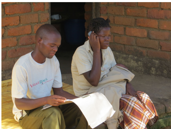
A woman uses a community volunteer's mobile phone to access the health message delivered by the Chipatala Cha Pa Foni project.

Mobile technology, specifically SMS and voices messages, can be successfully used to extend health information services to pregnant women